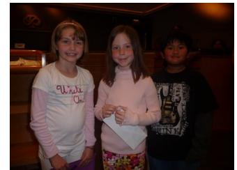
3rd Grade Winners