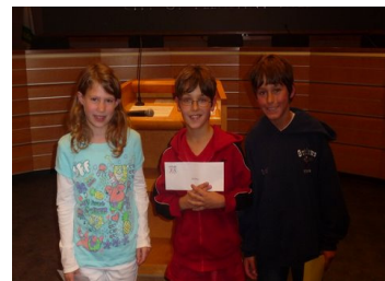
4th/5th Grade Winners